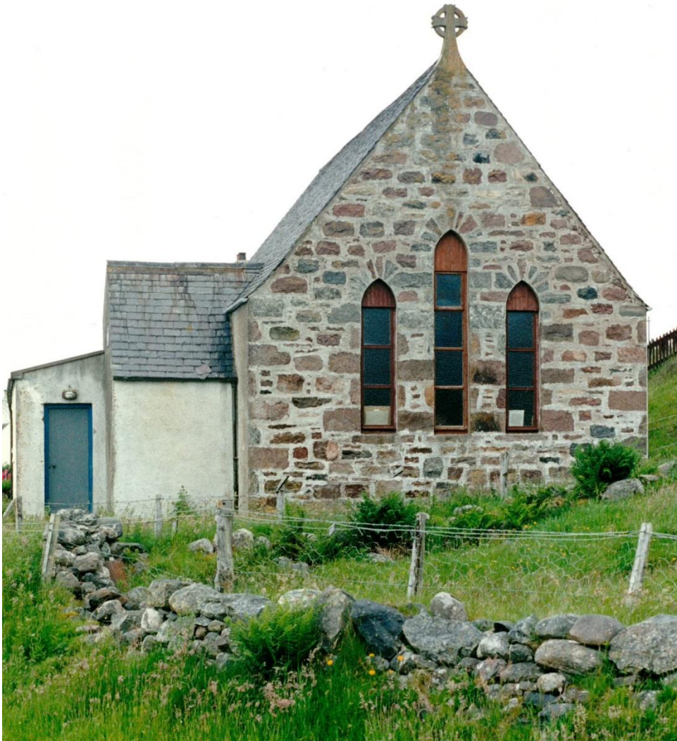
Lodge Loch Ewe No 1551 in Aultbea

The Quarterly Newsletter of the Province of Ross and Cromarty