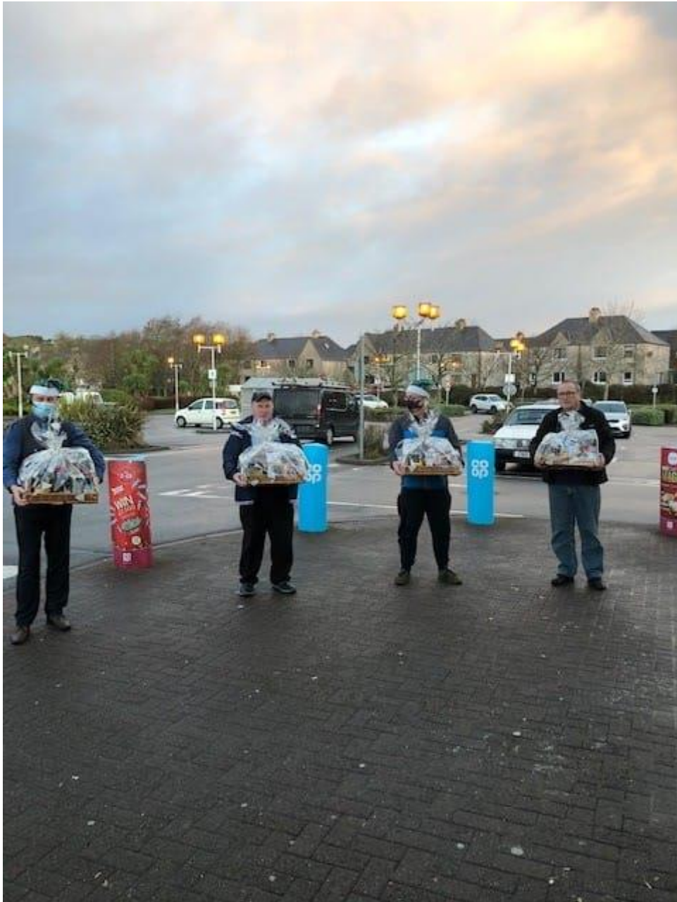
Brethren of Lodge Fortrose distributing food hampers